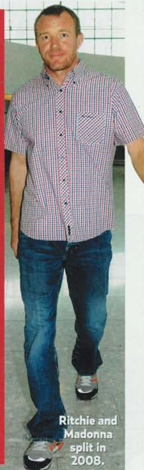
Ritchie and Madonna split in 2008.

W ELL, THIS CERTAINLY won't bring them any closer! Hot Stuff reported in early June that Gwyneth Paltrow and Madonna's decadelong friendship had hit a rough patch. And though they were photographed together at a dinner hosted by Diane von Furstenberg on June 23, Paltrow seems to have snubbed her onetime BFF again. A source says that when the actress, 37, threw a party with hubby Chris Martin at their home in London's Primrose Hill area on June 26, Madge, 51, was missing from the guest list. Meanwhile, the singer's ex Guy Ritchie , 41, was one of the attendees — and he brought a female guest! Still, the insult may not have been intentional. A different source says, "Chris always got along with Guy."